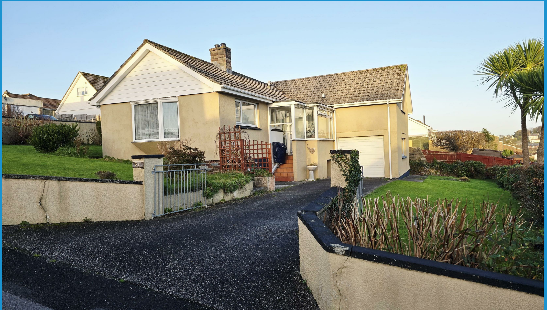
Meadowside Launceston | Cornwall